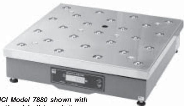
NCI Model 7880 shown with optional ball-top platter.

The Model 7880 Bench Scale provides the most accurate and reliable weight measurement for static or inline shipping. The weighing solution for any application requiring a durable bench scale.