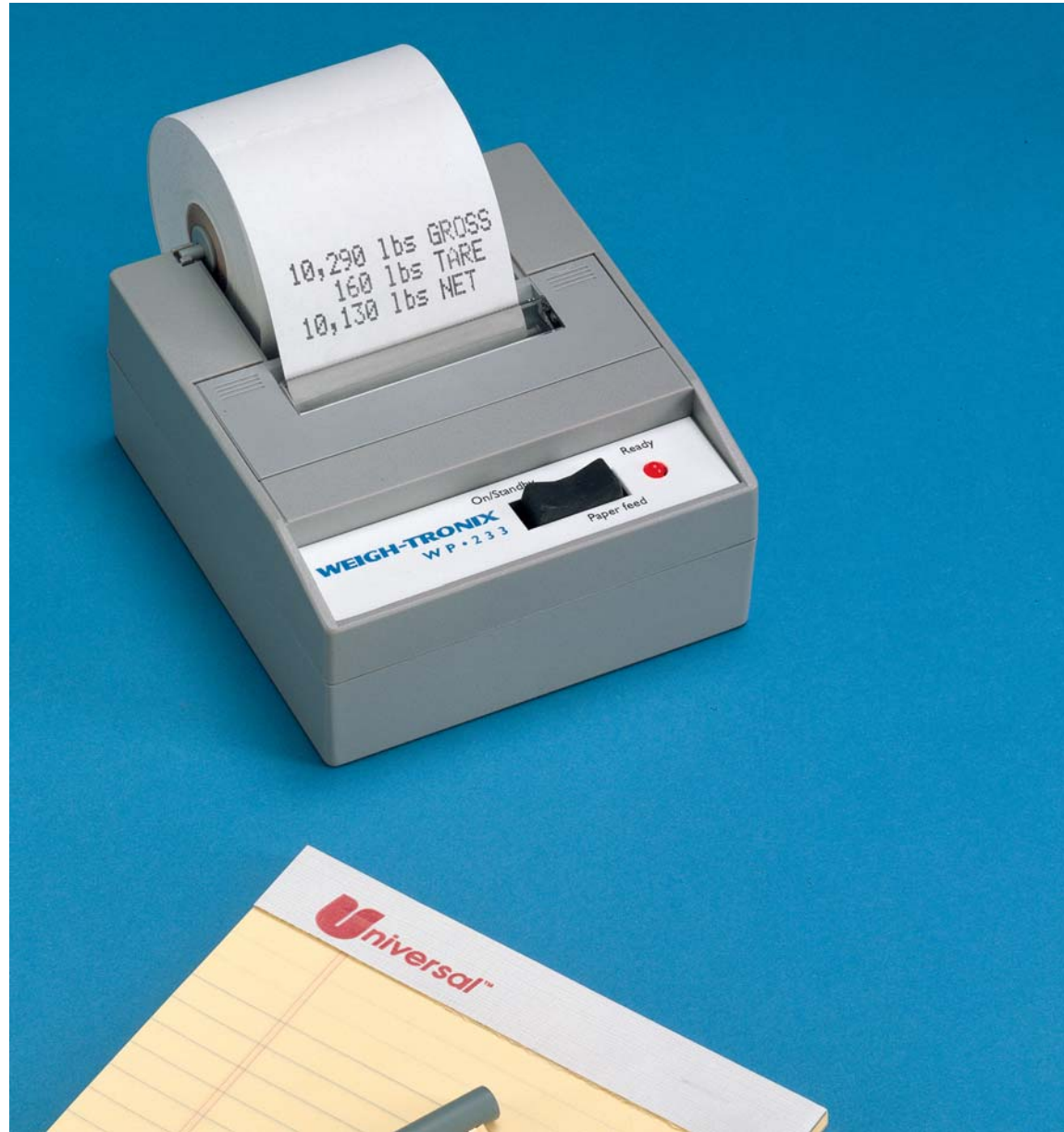
WP-233 Dot Matrix Impact Printer