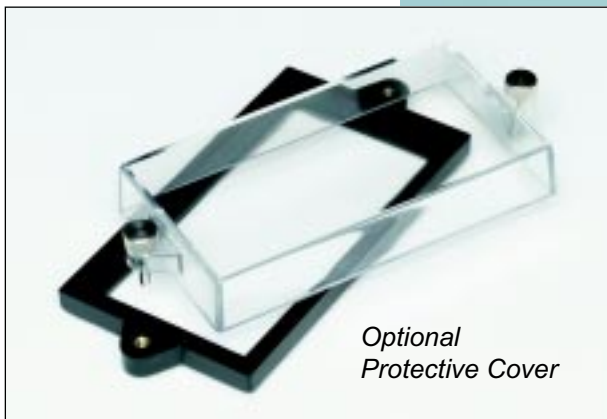
Optional Protective Cover